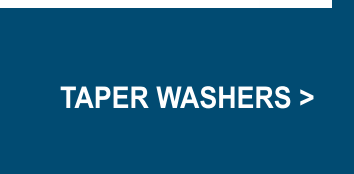
TAPER WASHERS >