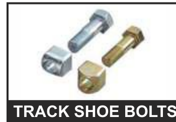
TRACK SHOE BOLTS