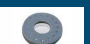
SPRING WASHERS >