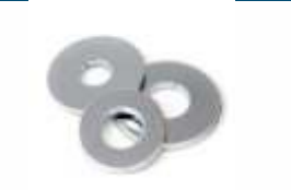
< PLAIN WASHERS